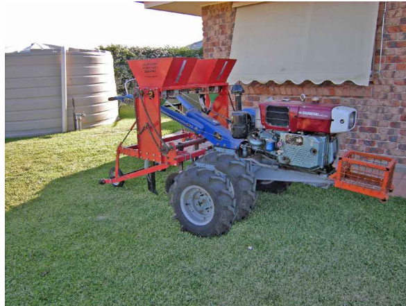
2WT with dual drive wheels (Photoshop impression)