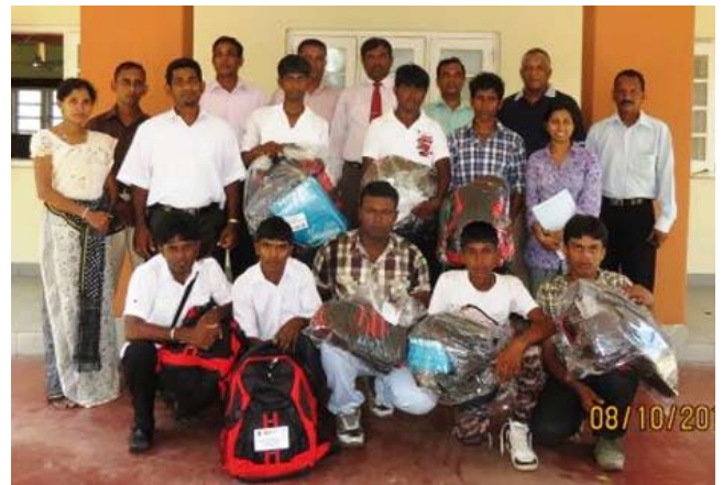
Trainees with basic repair equipment provided by RFLP

For more see: www.rflp.org/engine_repair_course