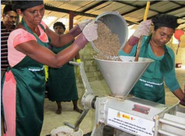
Community members get production underway

A coconut oil production facility operated by the fishing community of Sinnapaduwa in Sri Lanka's Puttalam district opened in November. Comprising 11 women and three men, Shwashakthi Coconut Oil Producing Enterprise was formed as part of RFLP's micro-enterprise development programme. Drawing on the vast supply of coconuts in the area the micro-enterprise helps diversify the livelihoods of this community which previously depended solely on fishing.