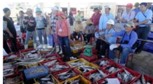
The pilot auction in action