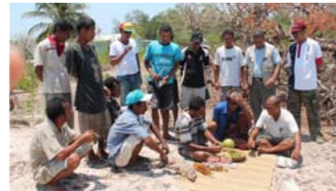
The sanction for violating Tara Bandu includes paying a fine as well as providing food and drink to be shared by the community

For more see: www.rflp.org/tara_bandu_example