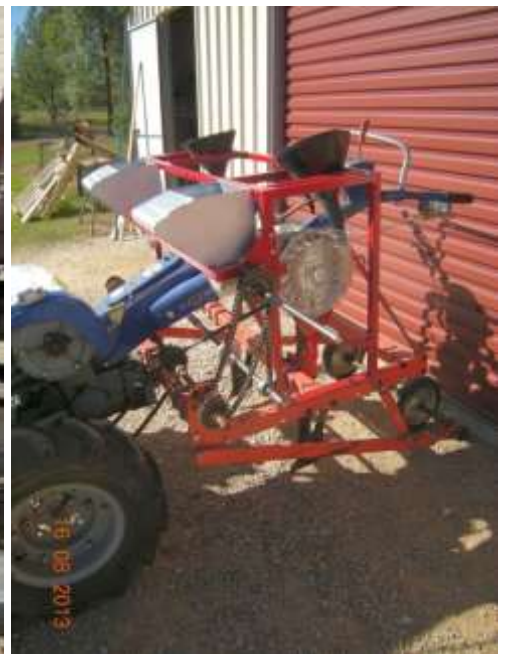
These views show more of the detail. The drive from the ground wheel goes to the original countershaft above the front tool bar. This further drives to a lay shaft immediately behind the front countershaft, and then to the vertical spoon feed meters. This set-up allows a variety of sprocket sizes to be used for maximum flexibility in choice of seed and fertiliser rates.