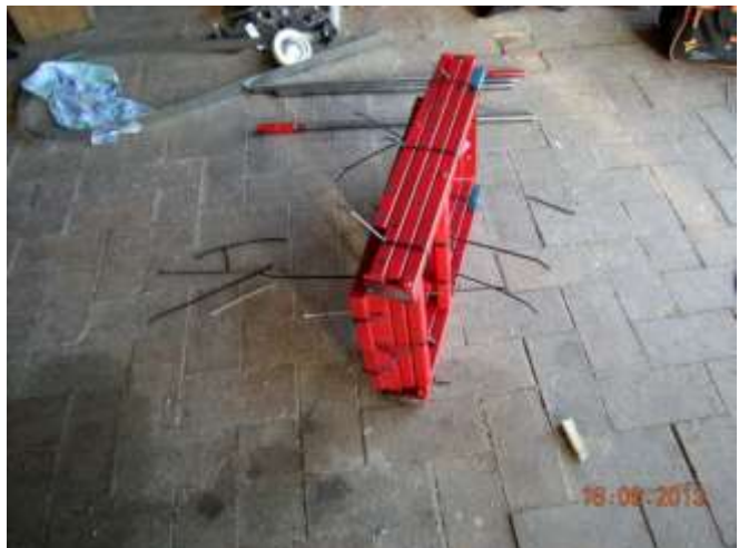
The seed delivery tube from the meter to the tine is shown on the left. If required, the tine can be removed, and a disc opener used as an alternate soil engaging tool. The picture on the right shows the frame 'flat packed' for transport to Africa.