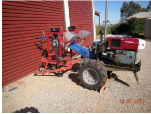
The basic frame (left) with the fertiliser meters. An overall view of the unit (right) showing the vertical spoon feed metering system and the fertiliser boxes. No down tubes or drive chains have yet been fitted. Note the 'temporary' seed boxes on the top of the seed drill.