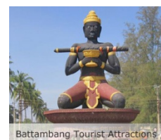
Battambang Tourist Attractions