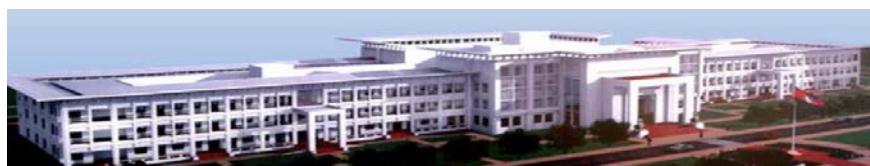
University of Battambang, Battambang, Cambodia

In this conference we are soliciting presentations about conservation agriculture production systems (CAPS) being developed in several regions of the world. We are seeking papers on CA research, teaching and extension.