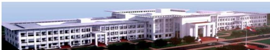
University of Battambang, Battambang, Cambodia

In this conference we are soliciting presentations about conservation agriculture production systems (CAPS) being developed in several regions of the world. We are seeking papers on CA research, teaching and extension.