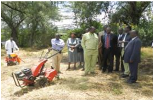
DEMONSTRATION OF THE 2WT DIRECT PLANTER AND MOTORIZED SHALLOW WEEDER

World Food Day celebrations in Nakuru County on 16 th October, 2013