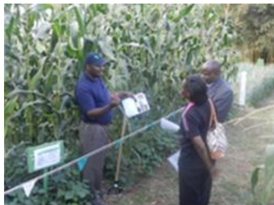
CA DEMONSTRATION PLOT AT THE EXHIBITION