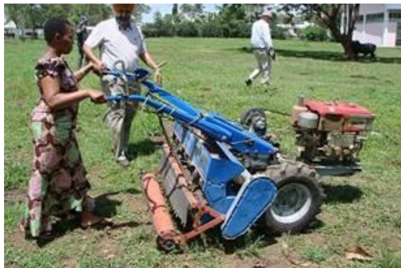
Conservation Agriculture for Resilient Food Security and Profitability in Machakos and Laikipia Counties of Kenya

FACASI: The Farm Mechanisation and Conservation Agriculture for sustainable Intensification-The overall goal of the project is to improve access to mechanization, reduce labour drudgery, and minimize biomass trade-offs in Eastern and Southern Africa, through accelerated delivery and adoption of 2WT-based technologies by smallholder