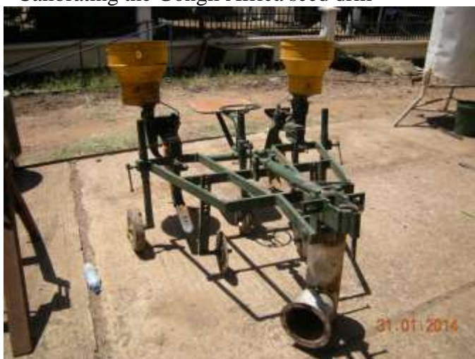
The Nandra 2 row 2WT seed drill