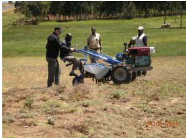
Driving instruction with the Dong Feng rotavator