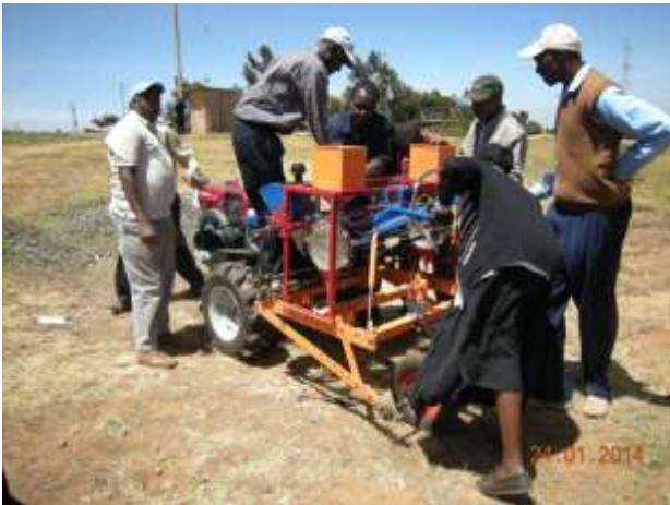
Assembling the Gongli Africa seed drill

KENDAT made trailing boom spray for 2WT.