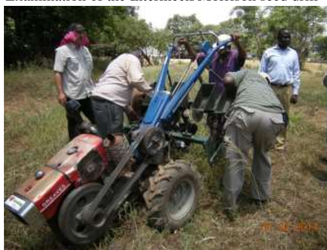
Field adjustments on the Intermech/Morrison drill

There were 15 delegates at the Kenyan module, and 12 at the Tanzanian component. At both trainings those with previous experience with 2WT operation were the most knowledgeable, asking many questions. On days two and three there were plenty of questions and much discussion on the maintenance and operation of these farm implements.