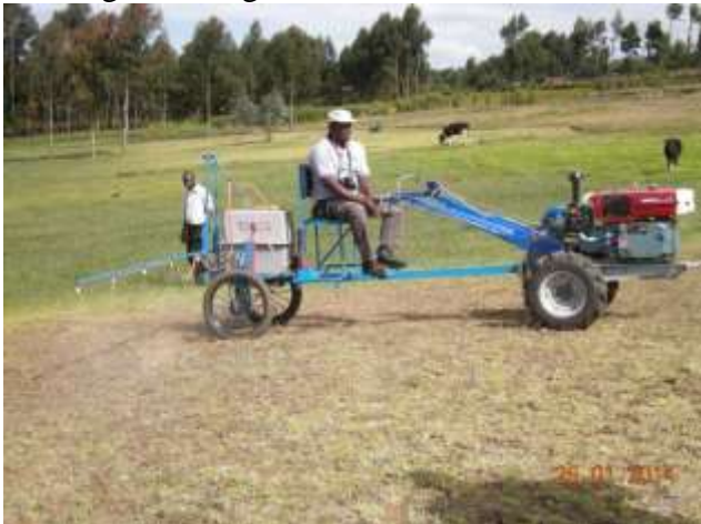
The KENDAT 2WT sprayer