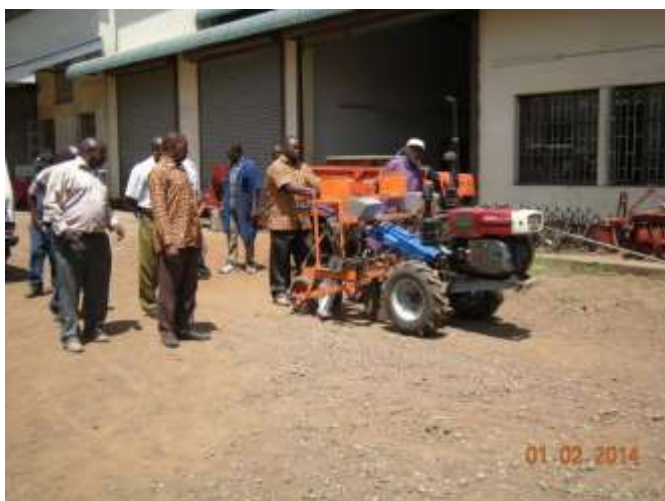
Calibrating the Gongli Africa seed drill

We therefore did extensive testing and demonstration on the Gongli Africa unit, as well as the Intermech/Morrison hybrid seed drill which was partly developed at CAMARTEC. A 2WT Nandra seed drill, made in Moshi, Tanzania was also inspected although not tested in the field.