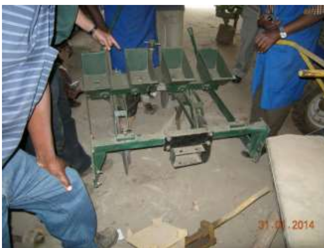
Examination of the Intermech/Morrison seed drill