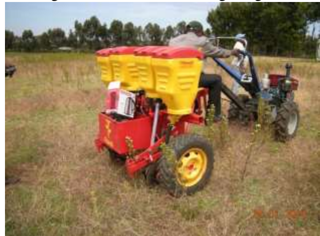
Testing the Fitarelli 2 row seed drill