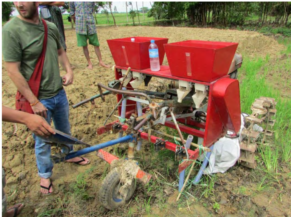
ARC Gongli planter showing cage wheels on 2WT, single depth control wheel and seat, and seed drop tubes tied 30cm above ground level on left side of planter.

The 2WT rubber wheels were replaced by steel cage wheels to get traction in the mud. Spacers were fitted to shift the wheels outside of the Gongli frame to avoid contact with the frame. A single jockey wheel replaced the press wheels to keep frame level, and allow the operator to be seated. The tynes were removed as the sowing boots blocked with mud and seed. The plastic sowing tubes were tied to the frame, and the seed was allowed to drop from 30cm above soil level.