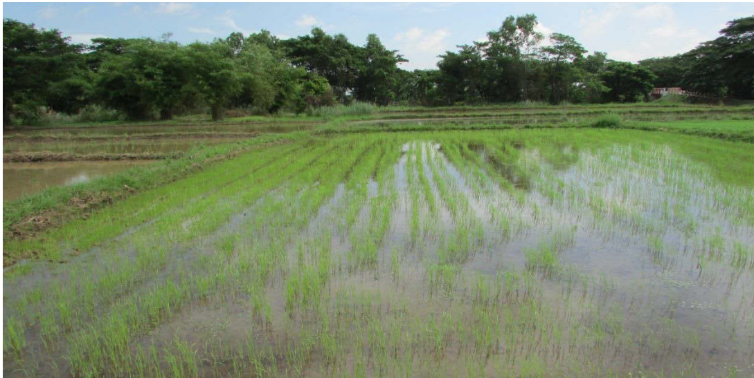
Rice crop sown with Gongli planter. The farmer would like closer rows, and less seed scatter.