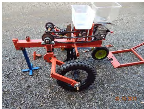
Details of the single tine (left) and a view from the side showing the chain drives (right)