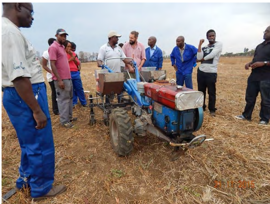
Field testing of the two row two wheel tractor planter.

On the final day, the completed planter was taken to a demonstration site about 10 Km from the University on a section of the University Research farm, which has been leased to CIMMYT. It was there given a field trial.