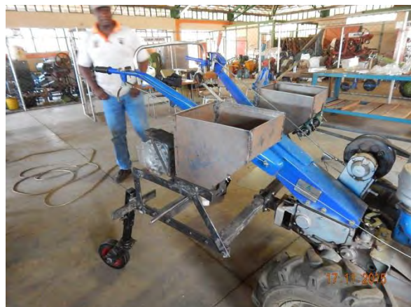
Joseph Mutua showing a side view of the implement (right)