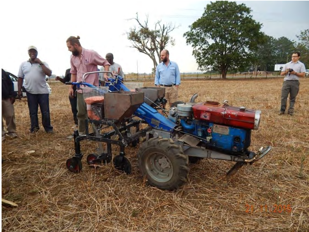
A second view of the field test