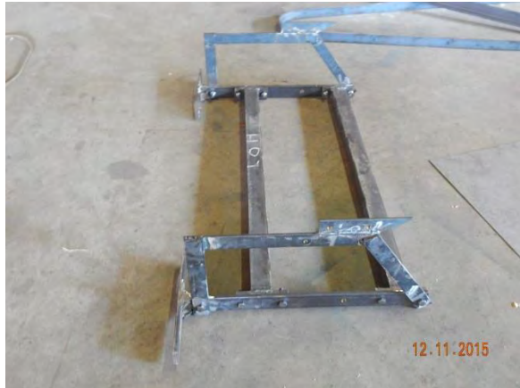
The basic two bar frame (right)

The frame consists of a two row tool bar, made from 50mm x 50mm x 3mm square section. An upright frame is positioned on either side, and this supports the seed and fertiliser metering mechanisms. Drive is from the tractor wheel through a chain, countershaft and clutch. The basic frame is 1000mm wide and 343mm C/C between the two tool bars.