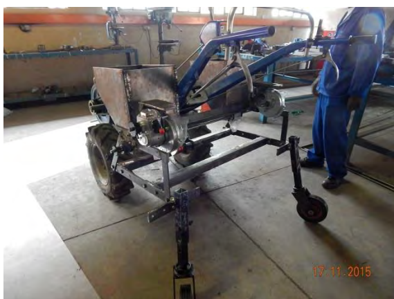
A rear view of the partly completed unit (left)

A pair of 50 x 16 x 500mm tine shanks was constructed from some existing tine shanks which were available from a previous CIMMYT prototype. Tine clamps with 50mm 'U-bolts were also made up. At the rear of the frame, a pair of 'T' section assemblies was fitted, to support the rear of the implement with a pair of swivelling tail wheels.