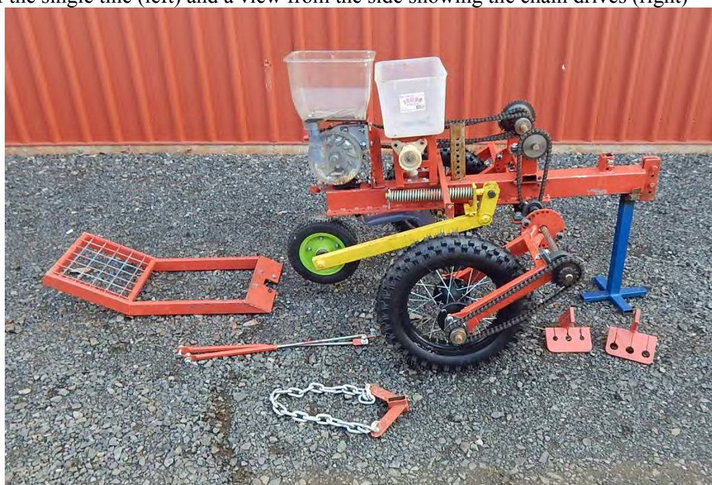
An overall view of the planter showing the press wheel, 12 spoon vertical seed meter, fertiliser mechanism, and the optional operator stand, support struts, covering chain harrow and tractor hitch (2 types available)

Due to the November deadline, the planters were sent to Indonesia immediately upon completion and are now being evaluated by Syngenta Foundation staff. As they are the first prototypes made in this configuration there may be some 'teething troubles'. These planters are not patented or covered by exclusivity agreements. Further details can be supplied on request.