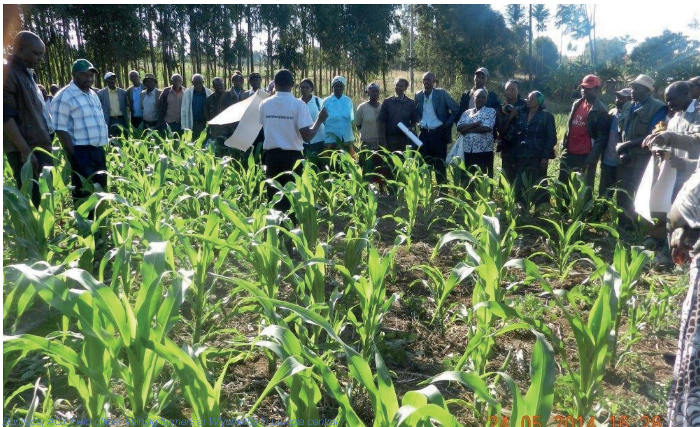
Background: ACT field officer training farmers at Wiyumbwa in Uganda central

For more information and important dates, link: http://www.agricultureandclimatechange.com/