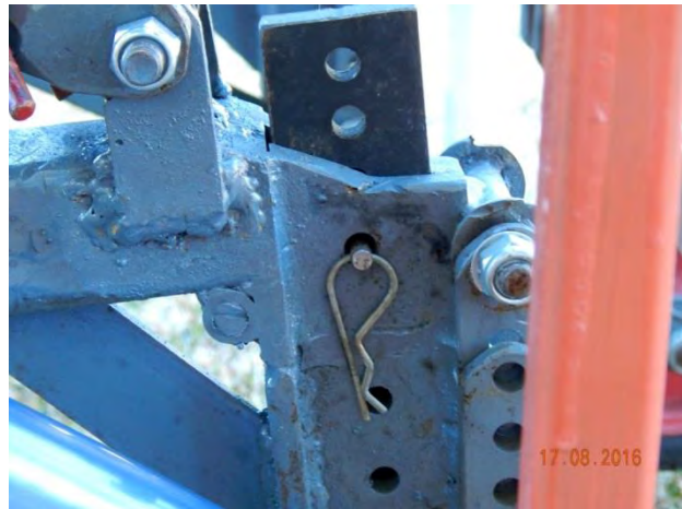
Spring loaded tines with adjustable tension clips (left) Adjustable depth tines (right)

The planter is practically complete, although quite a few small faults have yet to be rectified. It is a real challenge to incorporate all of the desirable features into the space available.