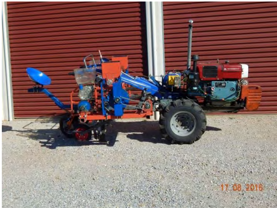
Overall view of the planter