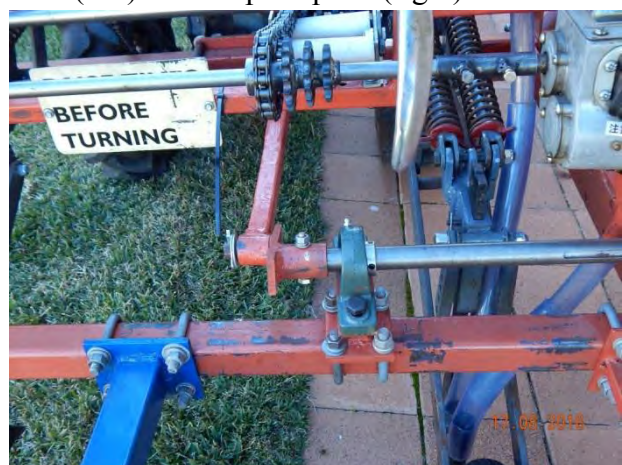
Seed and fertiliser drive clutch (left) The Pitman arm crank to turn the tool bar (right)