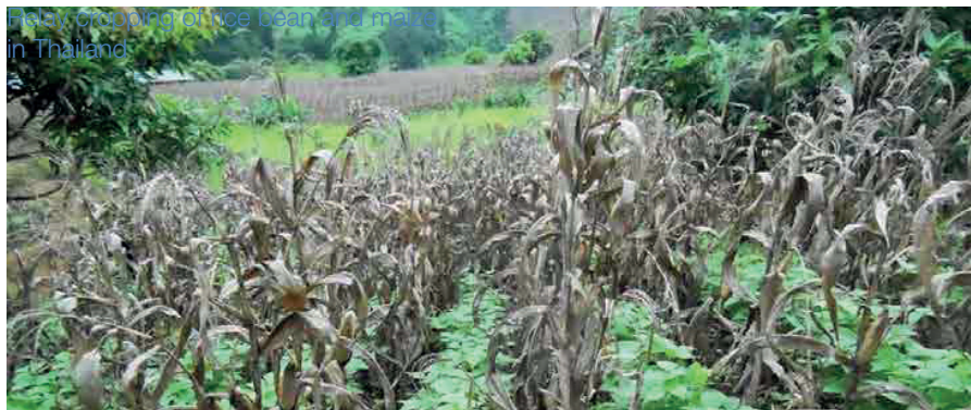
Harvesting of rice bean and maize in Thailand

ECHO has published a Best Practice Note on Conservation agriculture (CA) in October 2016. CA is a resource-saving land management approach that optimizes and sustains the capacity of soils to produce food. In CA, sustainability is linked to the ecological preservation of agricultural landscapes. This is achieved through 1) minimal soil disturbance, 2)