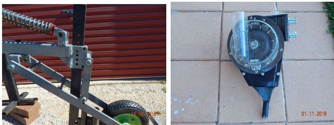
A tine shank showing depth adjustment (left) and a finger pickup seed meter (right) (The seed meter has a non-standard seed delivery tube.)

Another modification from the Fitarelli will be to make the draw bar a two piece unit, hinged on a 66-33 basis. The front section bolted rigidly to the tractor and the rear section free to swivel. This is nearly complete. Combined with the shorter overall length (due to seat position) the unit hopefully will more manoeuvrable on corners and at the end of the row.