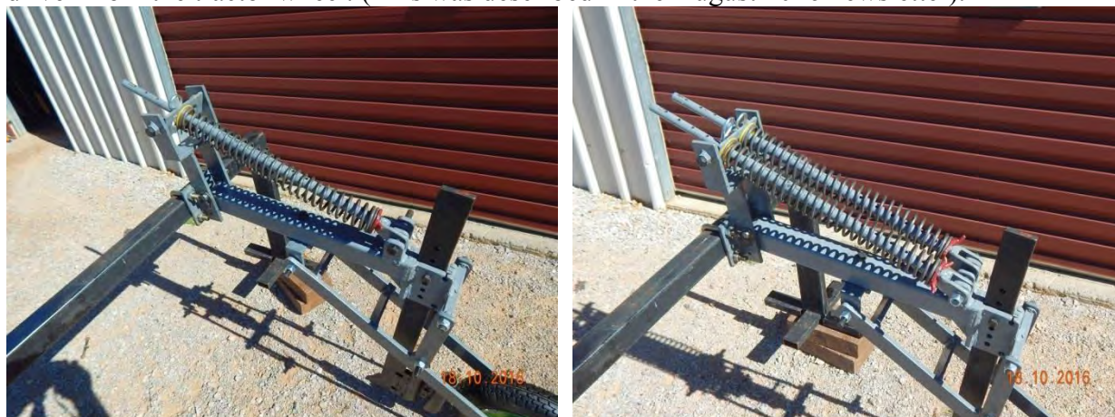
Spring loaded tine with single spring (left) and double spring (right)

The springs for the tines are the same as those fitted to the mounted model. The mounted two row planter is essentially the same as the trailing unit, except it does not have gauge wheels fitted, and is driven from the tractor wheel. (This was described in the August 2016 newsletter).