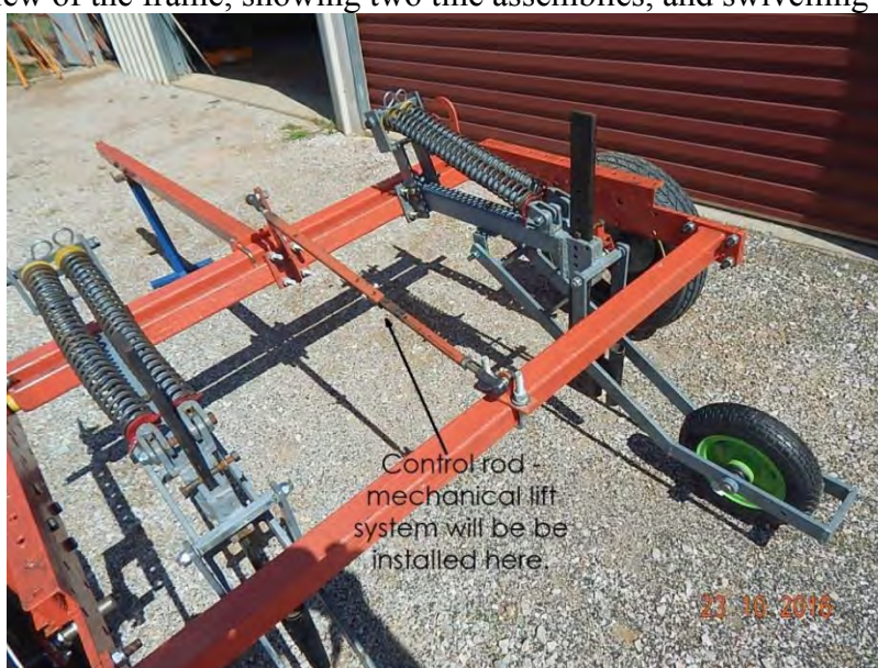
The frame in rear quarter view (lift system yet to be fitted)