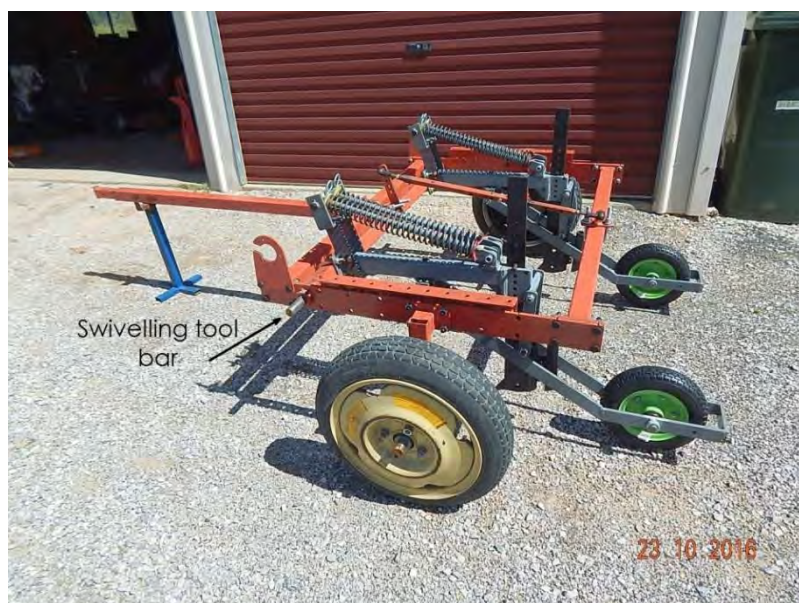
Side view of the frame, showing two tine assemblies, and swivelling tool bar.

All of the other parts are on hand- Two finger pickup seed meters- courtesy of Syngenta Foundation - and some fertiliser meters as well. The seat will be positioned between the two soil engaging tine assemblies - which will make the overall length shorter (The Fitarelli has the seat in front of the frame). The proposed lift system mechanism will be under the seat. However shields will have to be fitted around the seat to stop moving parts chewing up the operator.