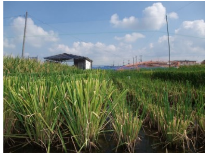
Comparison of the two cut heights of rice five days after harvesting the first crop.

"Our results suggest that combining the nor-