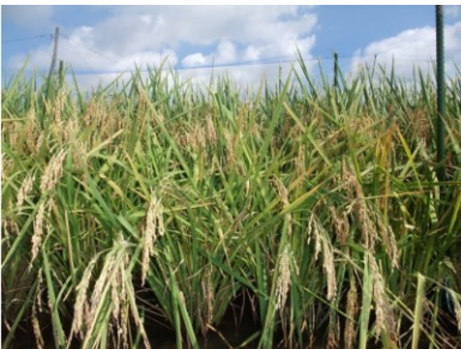
Rice seeds are arranged on the plant in groups, called spikelets. This field of rice is ready for harvest.

Rice plants harvested at the normal time for the first crop yielded more seed than the rice