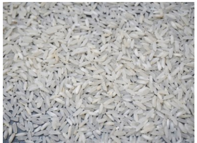
Many people across the globe rely on rice as a source of nutrition.

"The goal of our research is to determine the effects of harvest time and cutting height of the first harvest on the yield of the first and second rice crops," says Nakano. "Ultimately, we want to propose new farming strategies to