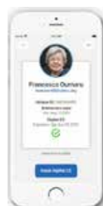
Digital Certificate of Entitlement (CE)