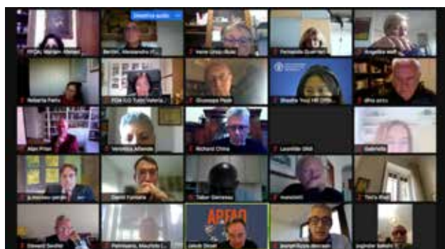
participating FFOA members