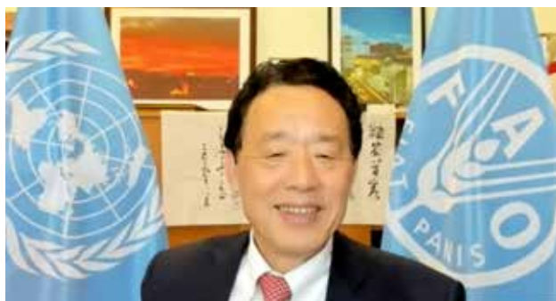
Dr Qu Dongyu, Director-General, FAO

For the second consecutive year the Director-General of FAO, Dr Qu Dongyu honoured the Assembly with his presence. He renewed his commitment to engage with FFOA and underlined the valuable contribution of retired staff to the work of FAO, the RBAs